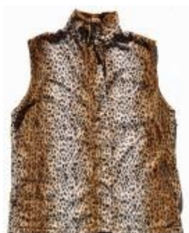
Woman's JAGUAR print vest w/o JCNA Logo $45.