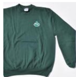
Men's and Women's Sweatshirt $35.00