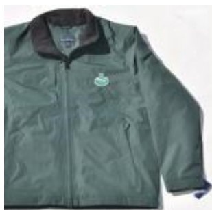
Men's Lined Jacket $65.00