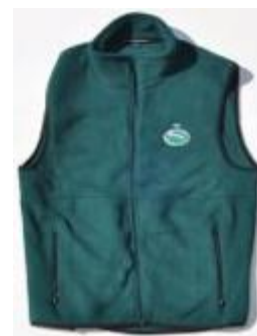
Men's and Women's dark green vest $45.