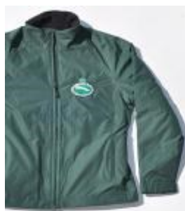
Women's Lined Jacket $65.00