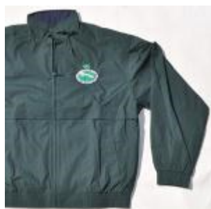
Men's Windbreaker $55.00