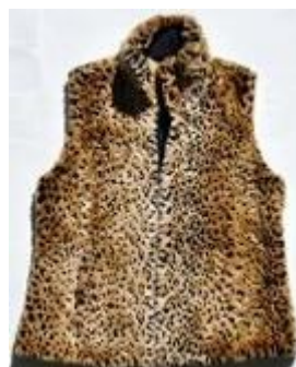
Women's JAGUAR print fleece vest w/o JCNA logo $55.