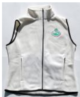
Women's white vest with JCNA logo $45.