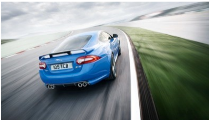
European Model Shown