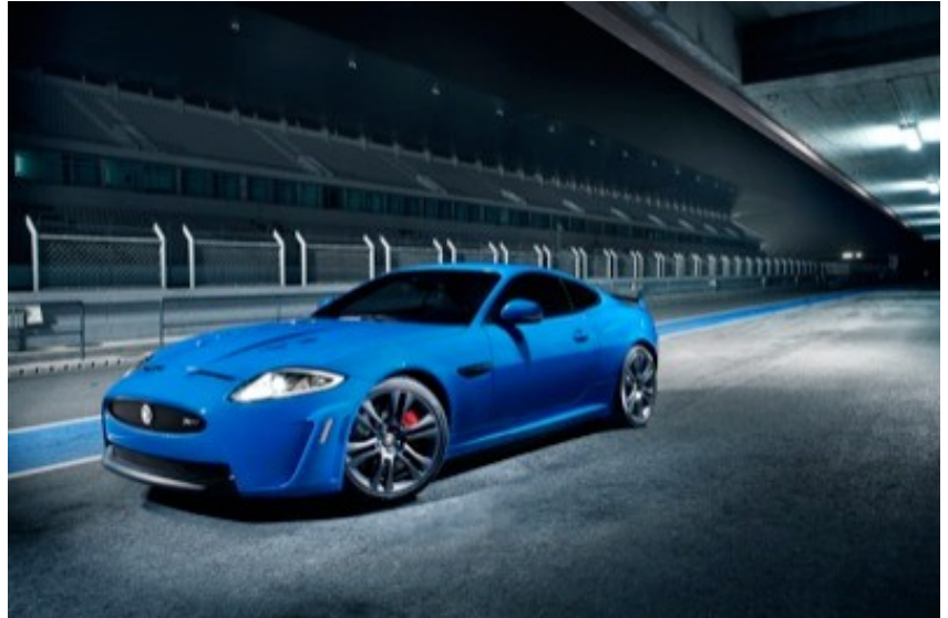
European Model Shown

MAHWAH, N.J., February 22, 2011 – Jaguar will launch the new Jaguar XKR-S at the Geneva Motor Show on March 1, 2011. With a higher output supercharged V8 engine, revised suspension, and a new aerodynamically driven design, the Jaguar XKR-S expresses the company's long held duality of purpose: GT luxury with incredible performance.