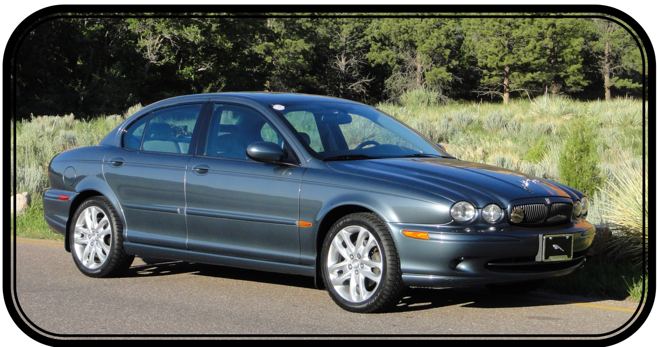
Keith Winton's 2002 Jaguar X-Type