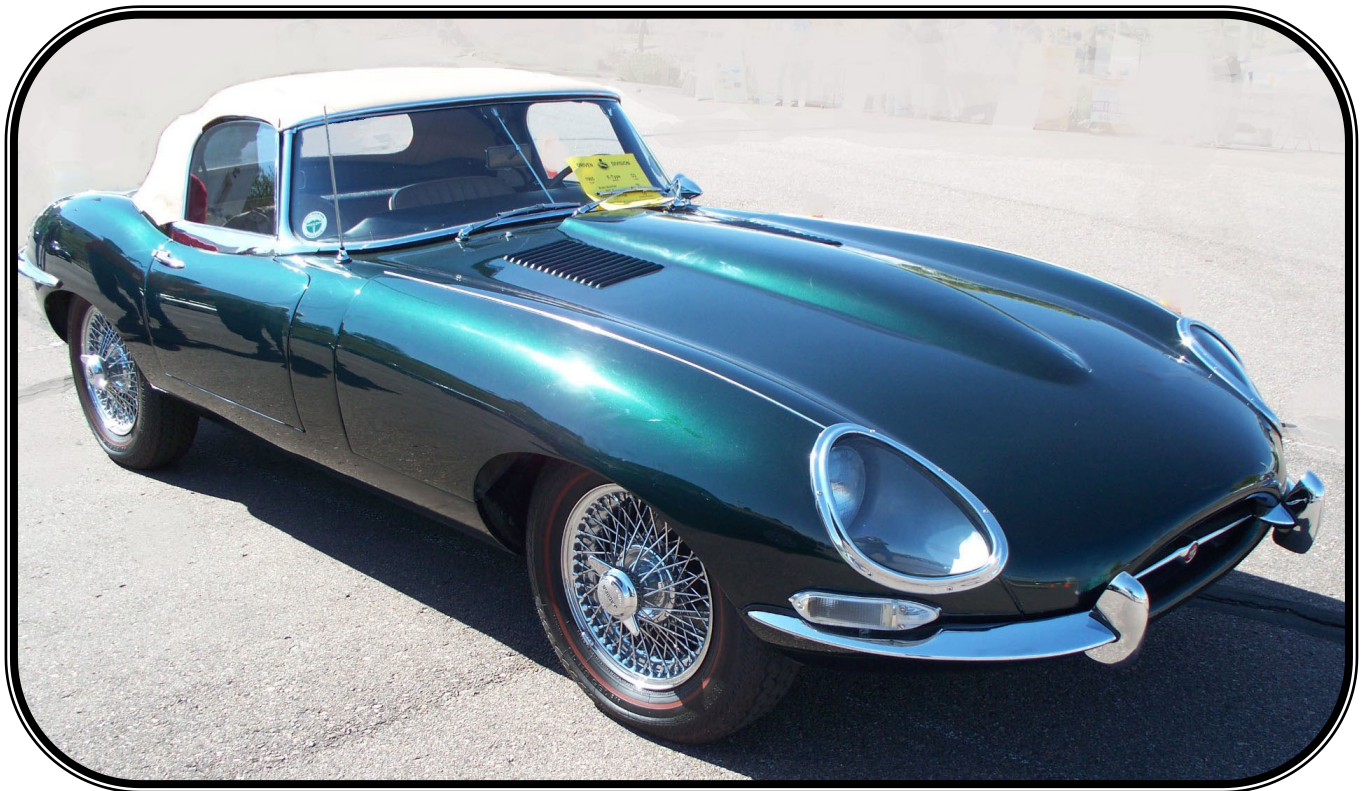
Budd Butcher's 1965 E-Type Roadster