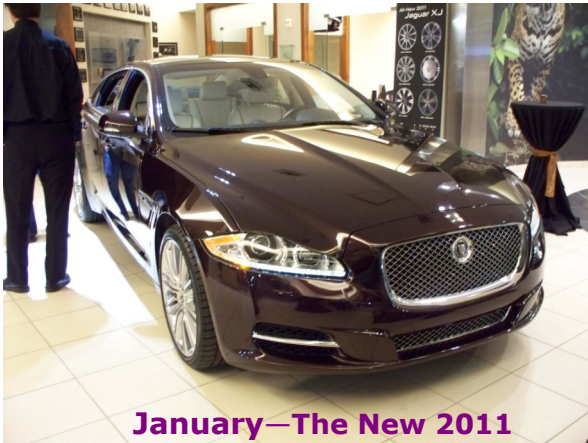
January—The New 2011 Jaguar XJ

March - SBGs interior and exterior Jaguar care presentation