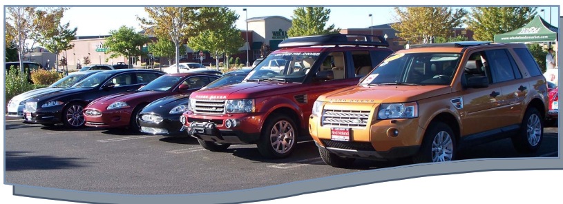
Labor Day - First Saturday's Car Show, First and Main Town Center