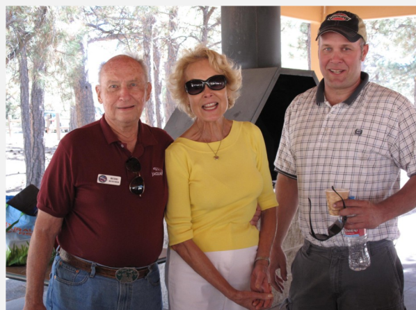
The FIRST ANNUAL JCSC PICNIC US Air Force Academy