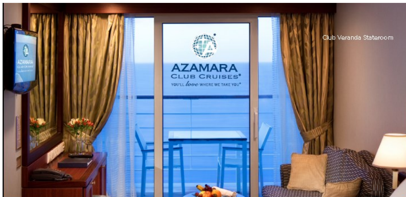
Club Veranda Stateroom

IN ADDITION TO THIS GREAT OFFER, BOOK BY APRIL 26, 2014 AND RECEIVE $500.00 PER STATEROOM ONBOARD CREDIT-CALL FOR DETAILS!!