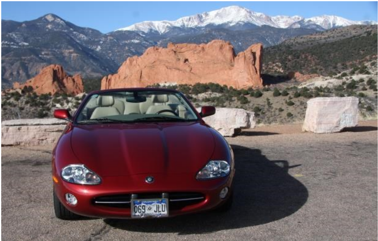
Roy's XK-8 in one of the best photo locations in Colorado Springs. Great job, Keith!