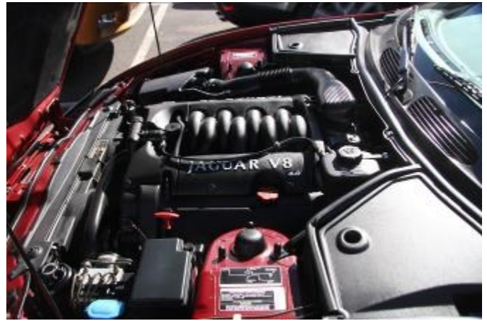
The cockpit and the engine compartment of this gorgeous cat!