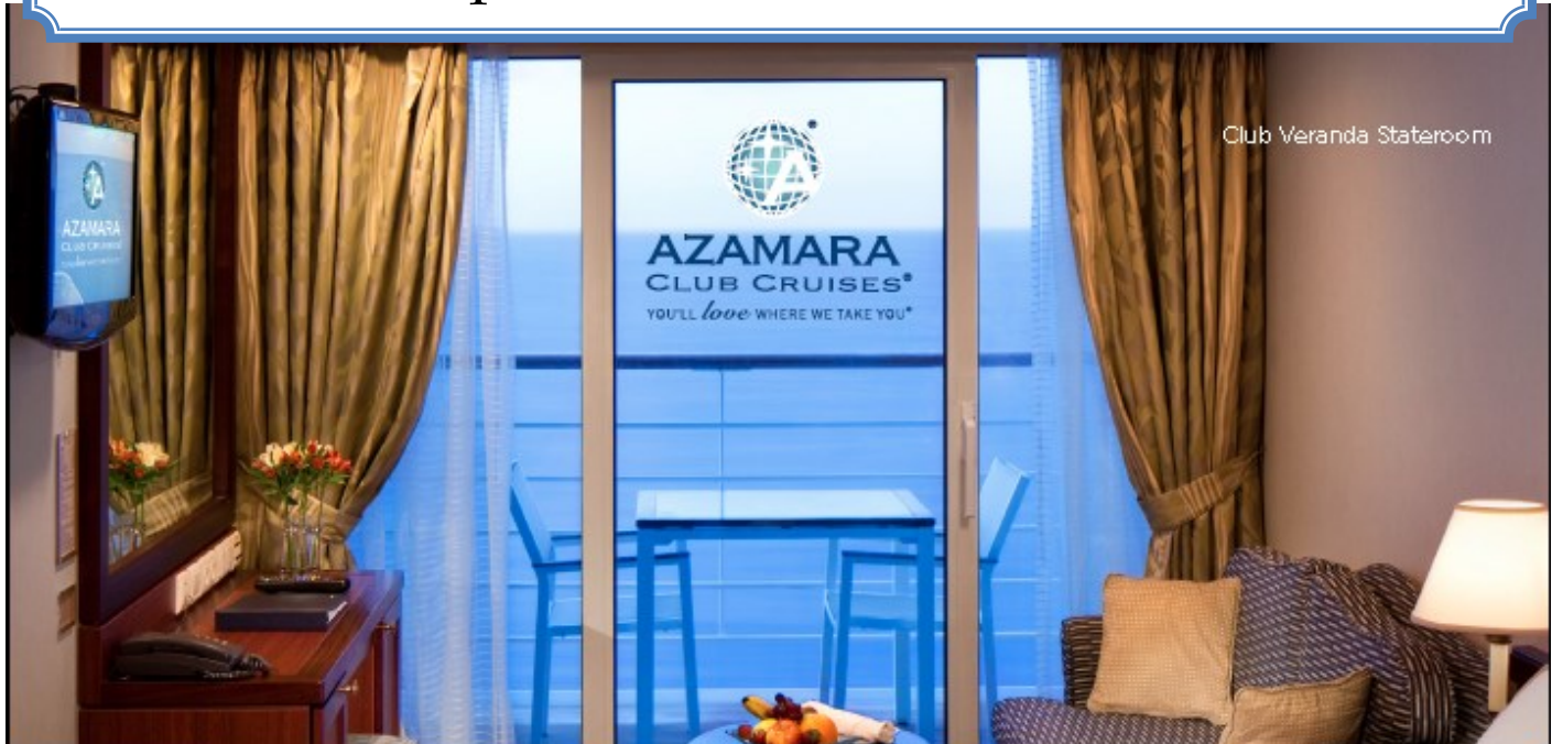
Club Veranda Stateroom

longer STAYS. more OVERNIGHTS. nightTOURING.™