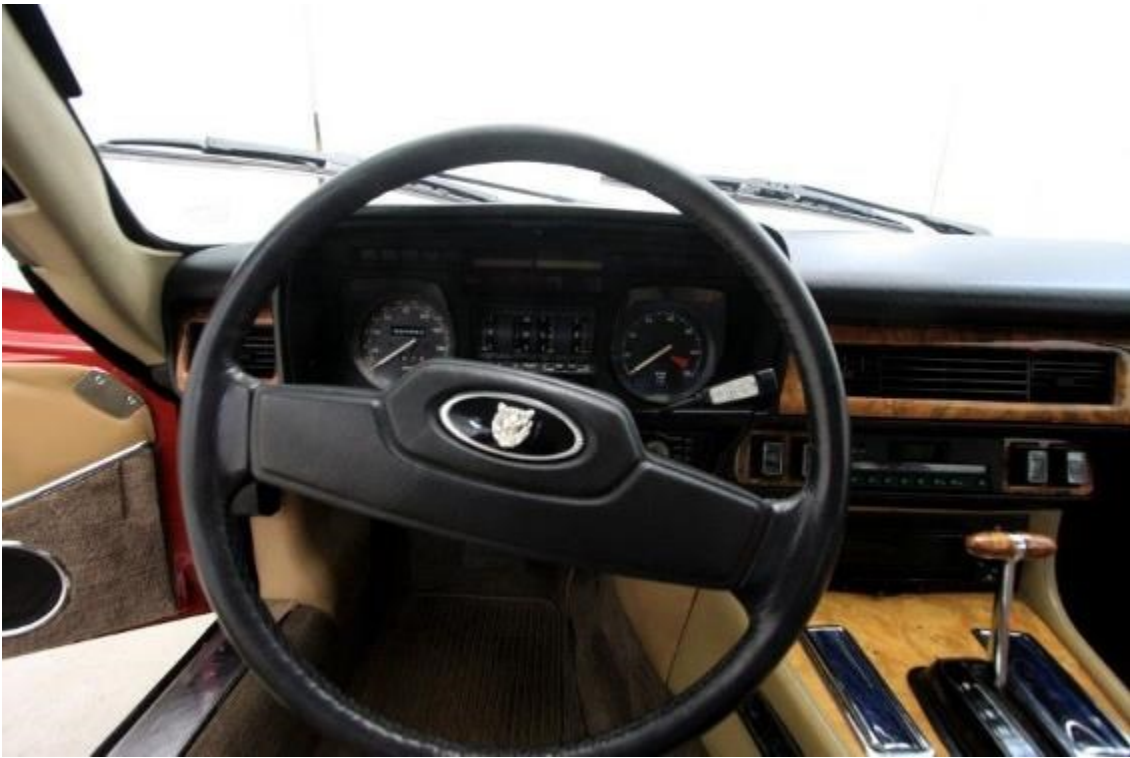
Inside Budd Butcher's 1988 Jaguar XJ-S V-12