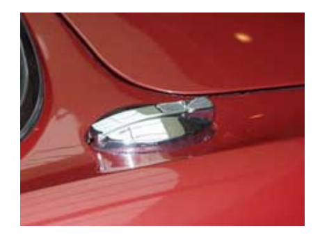
Two chromed, exposed gas caps, with one on each side. Not removable Jack's Army tanks had a similar arrangement.