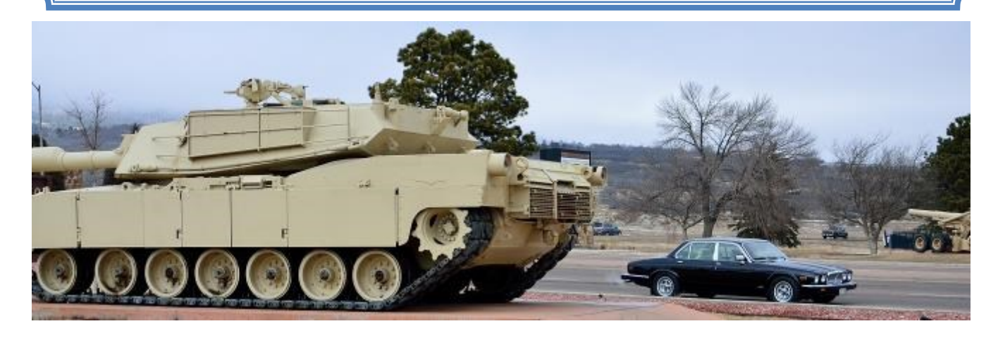
An M1A1 tank dwarfs the XJ6.