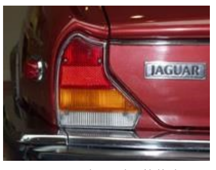
Crescent shaped tail lights.