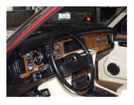
Aircraft-style, with four smaller gauges flanking two large ones.