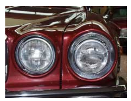
Two round lights on a side, with one in the fender (wing), and one in the hood (bonnet) such that it points down when open.