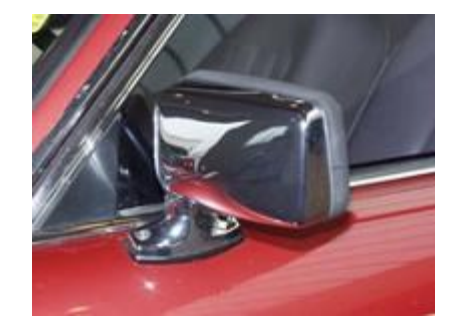
Chromed metal, with rubber lip around the edge.