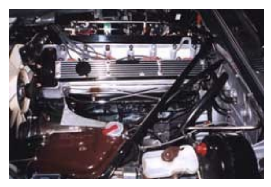
Obvious cross braces connecting the fenders to the firewall..

One more "how you know you have a Jaguar XJ Series III" clue.