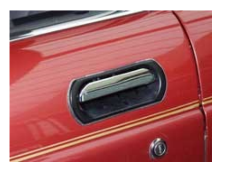
Ovoid, metal. Lock mechanism mounted in door separately.