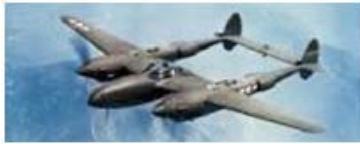
P-38 Level (continued)