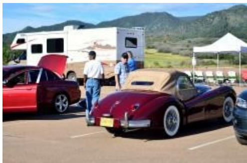
Western States Slalom