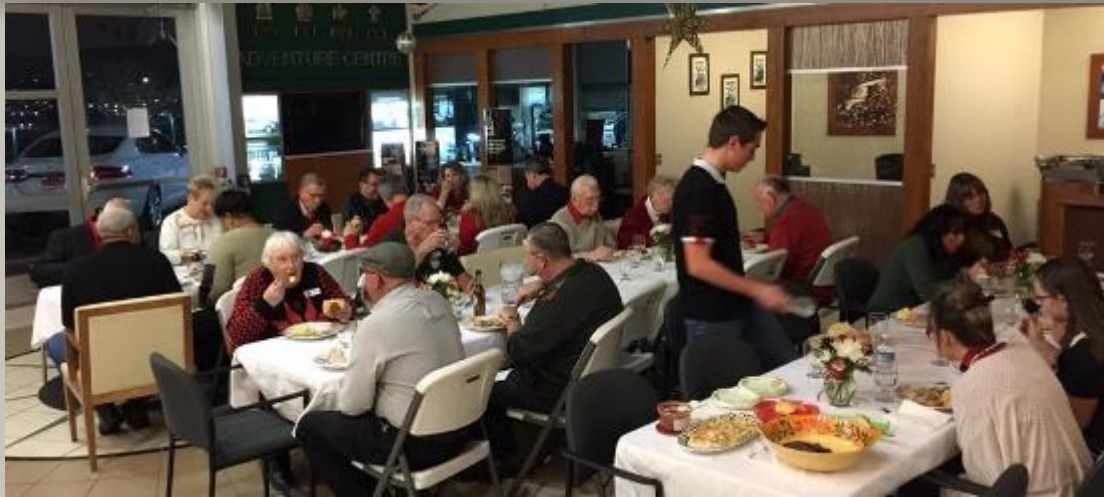
Happy "Jaguar" Holidays, 2015