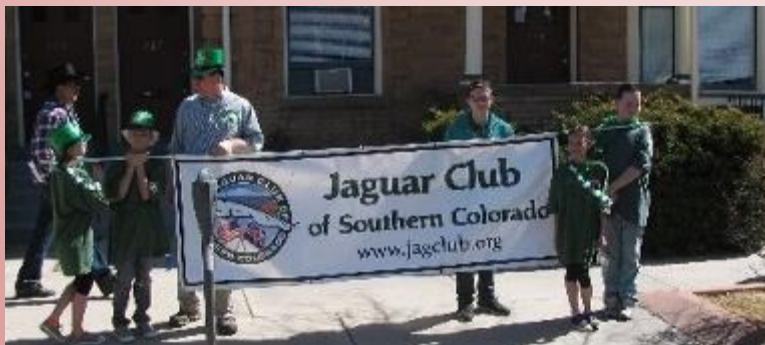
Photos from the 2011 JCSC parade event.

https://www.eventbrite.com/e/st-patricks-day-parade-jaguar-viewing-tickets-20781126910