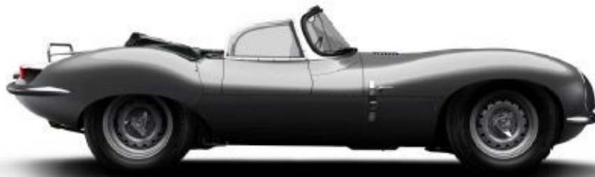
One of the original sixteen XKSS models from 1957