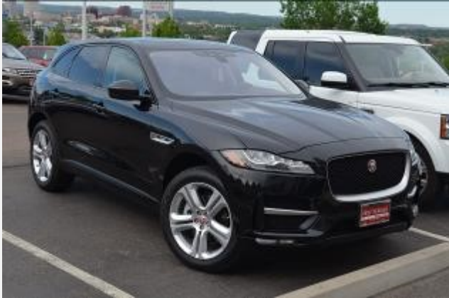
2017 Jaguar F-Pace.