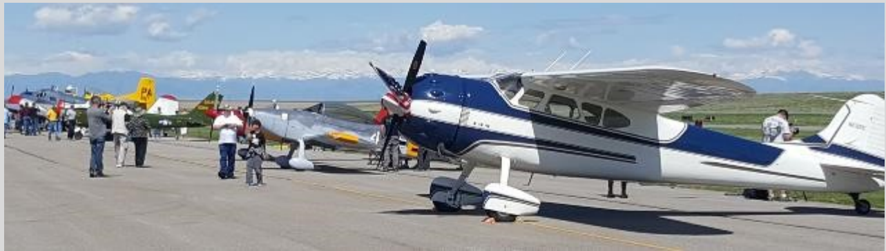
Aircraft on the Front Range Airport ramp..