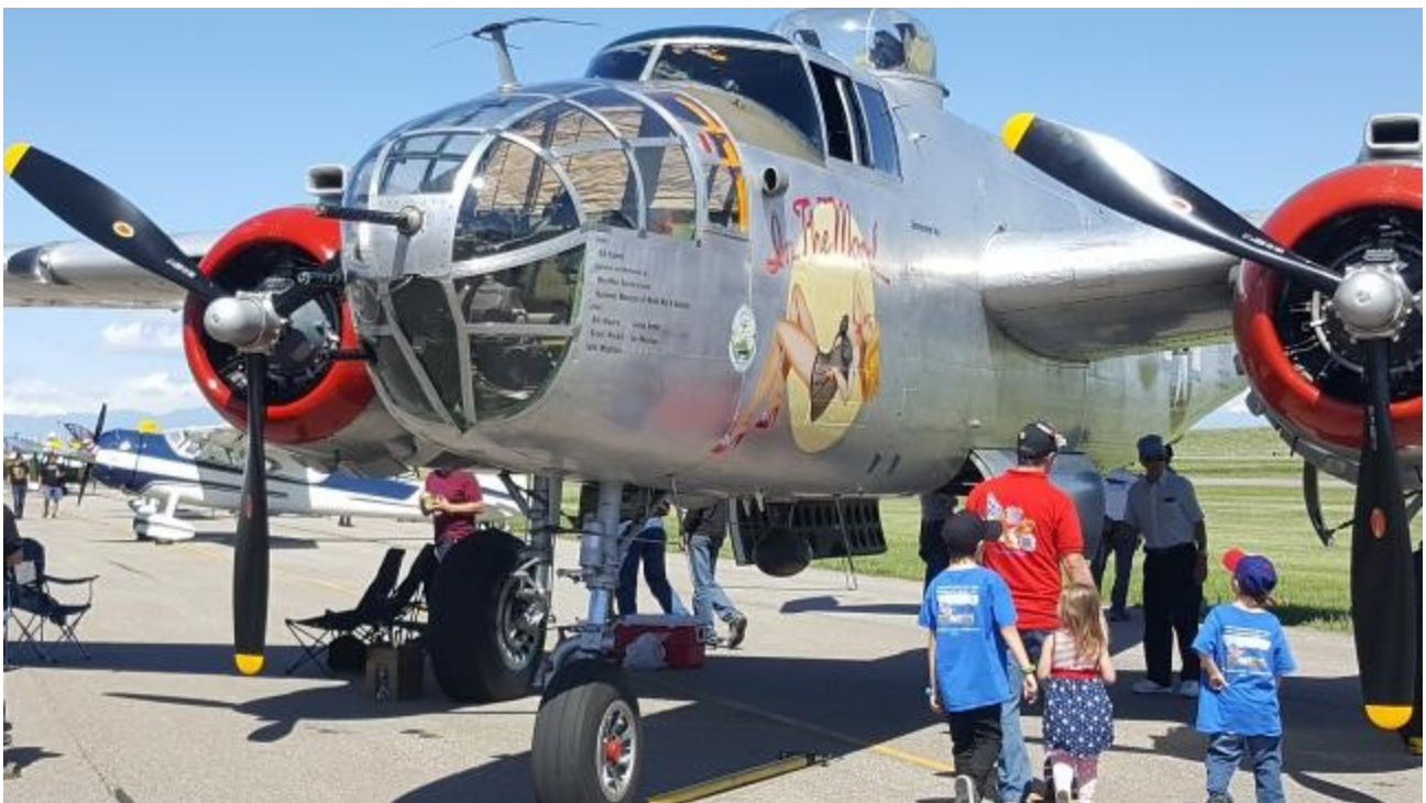
B-25 'In The Mood' from the National Museum of World War II Aviation In Colorado Springs