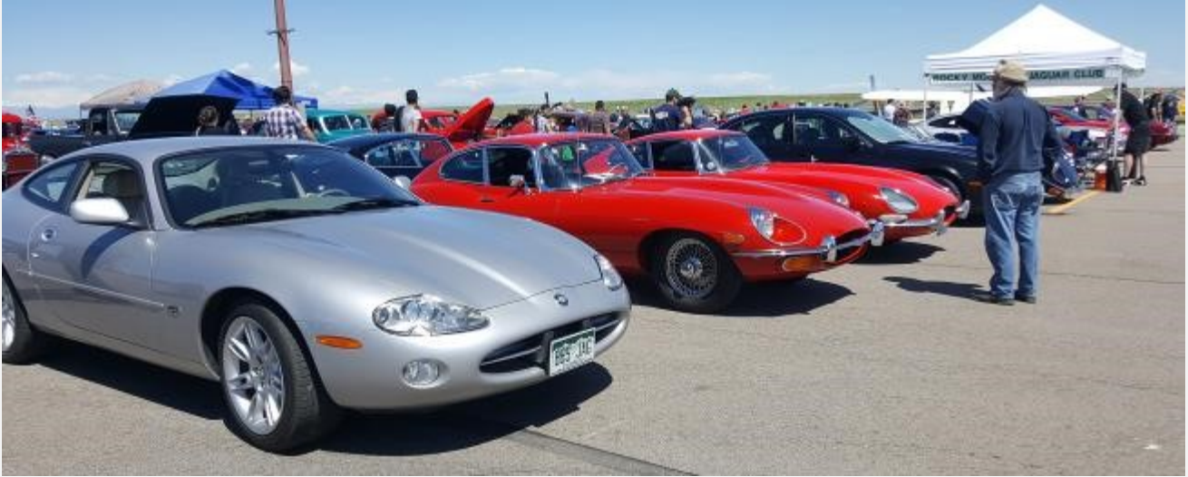
Rocky Mountain Jaguar Club display area