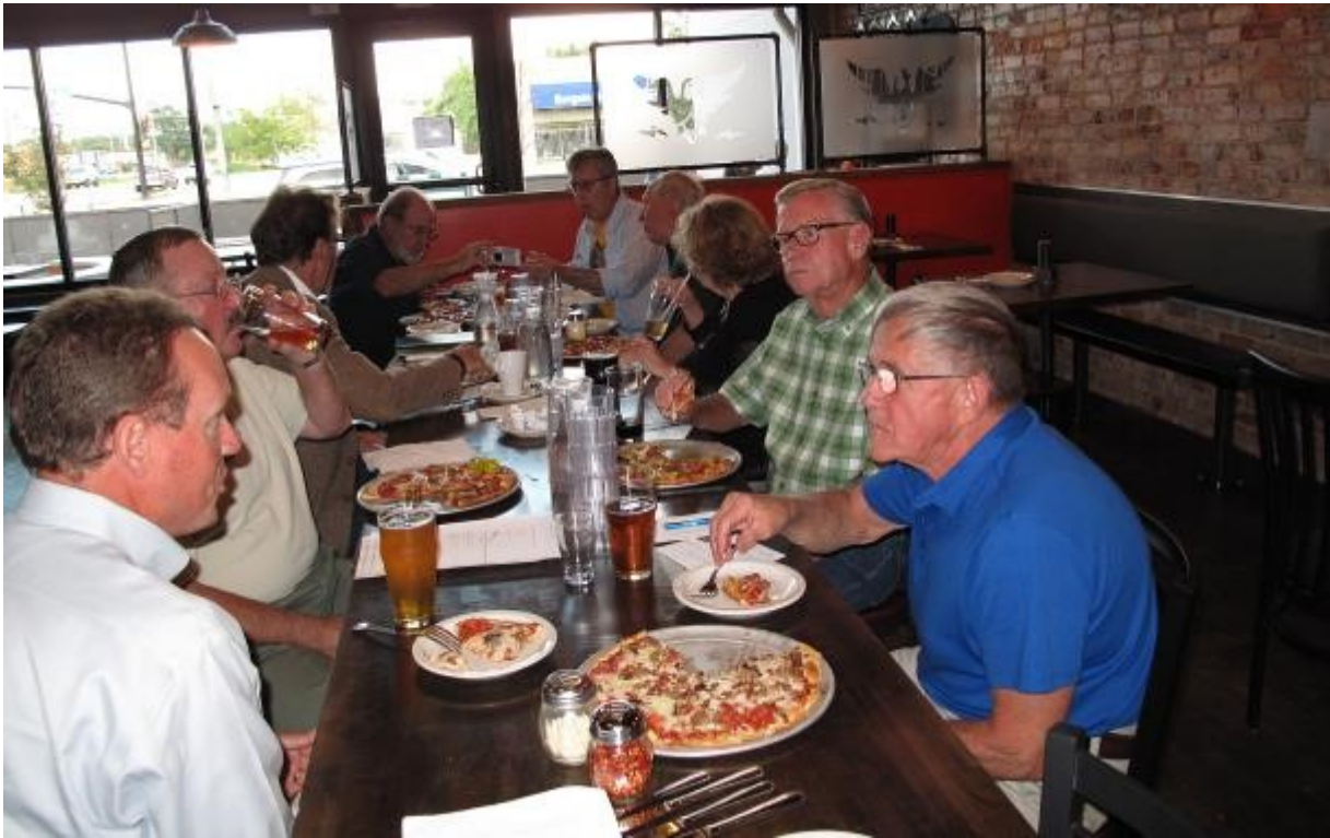
The August Jaguar Club of Southern Colorado Club Dinner at the Iron Bird Brewing