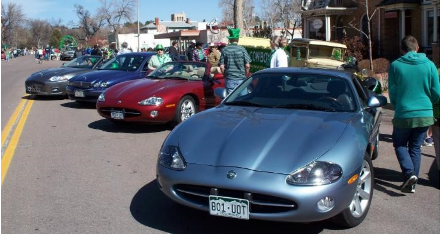
Saint Patrick's Day Parade—March, 2011