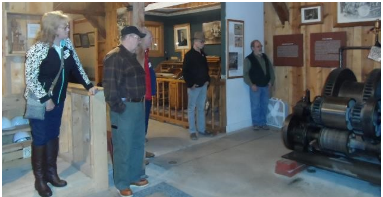
Air powered mine hoist.