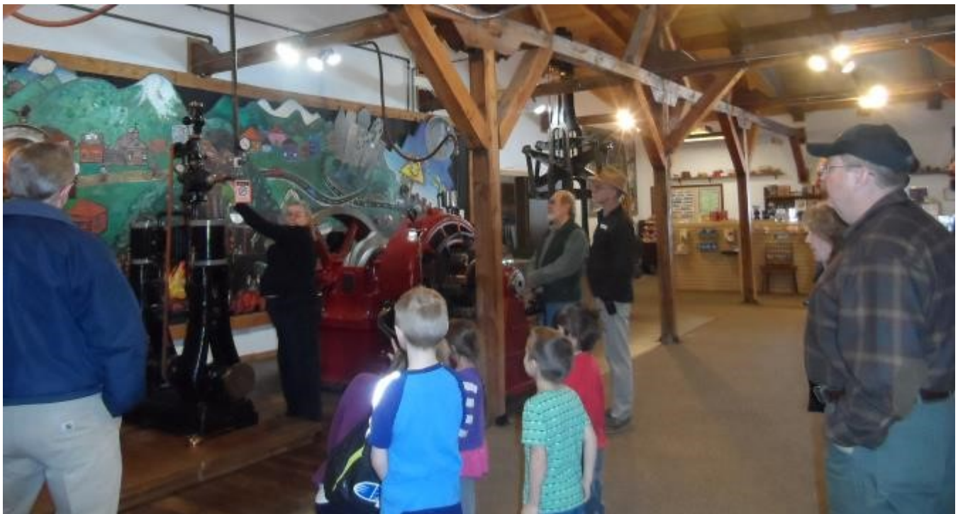
Early electric generation equipment.