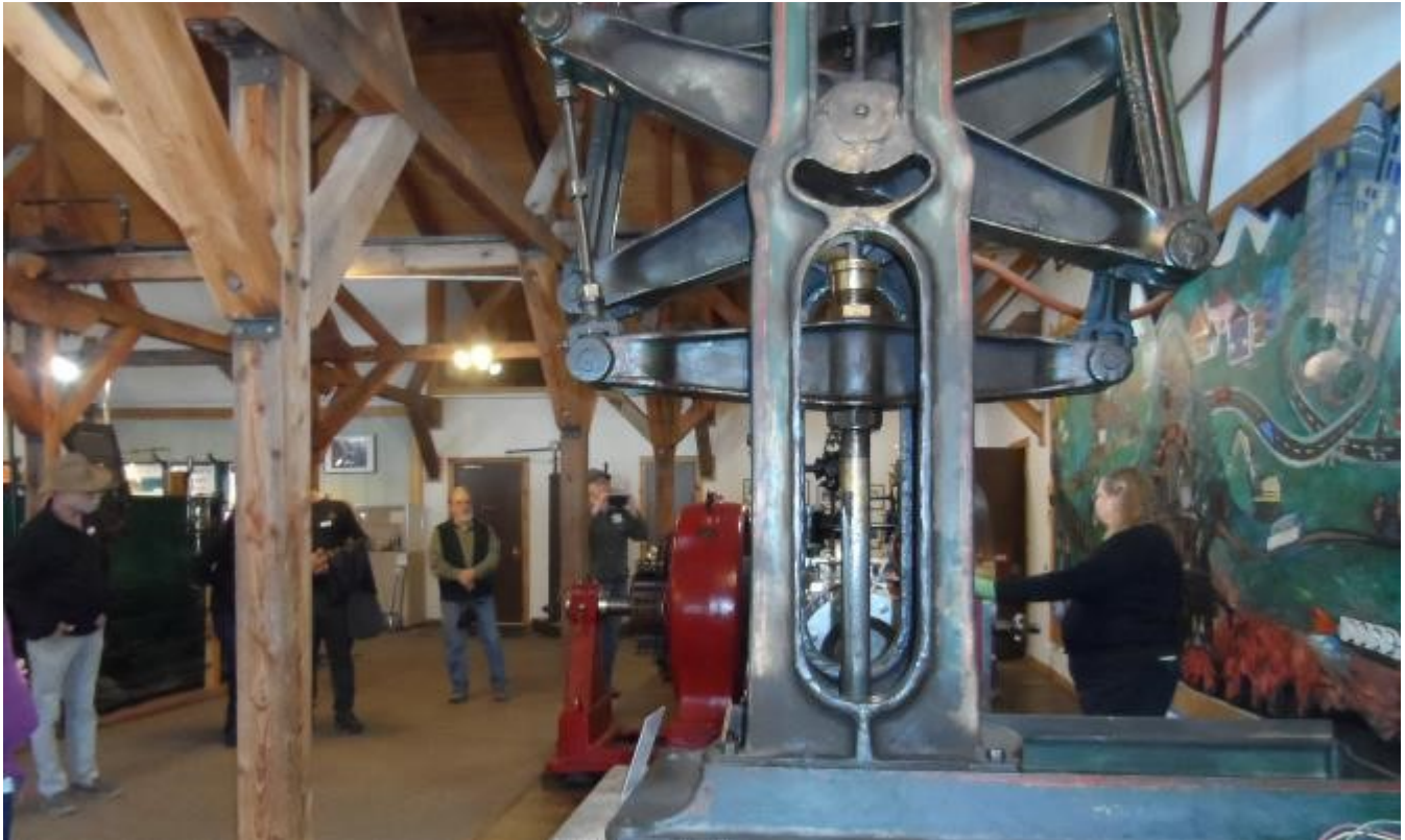
Antique pump for dewatering a mine