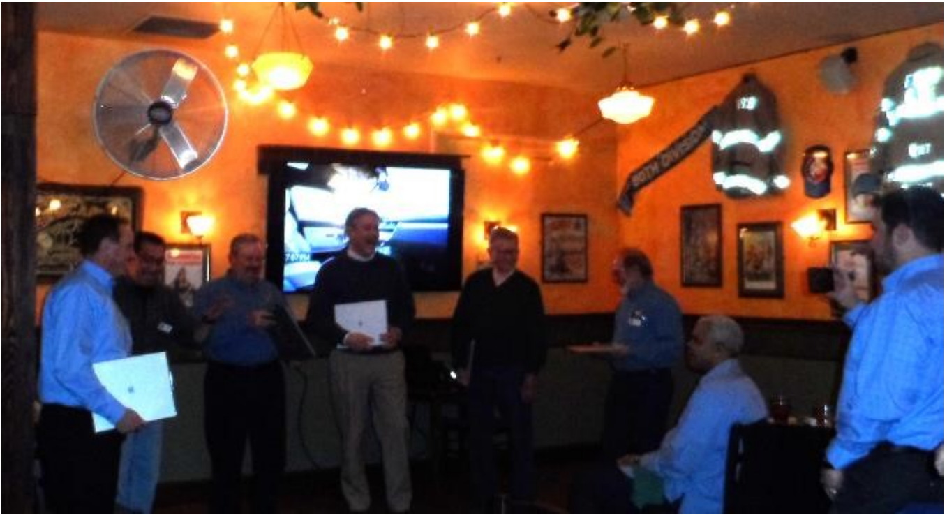
Jack Quinn's Irish Pub was the location for our first quarterly Membership Dinner and Meeting.