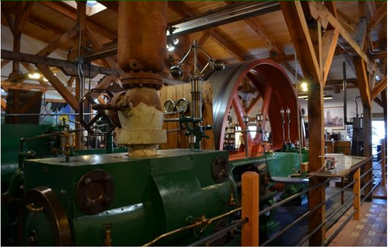
Corliss Steam engine