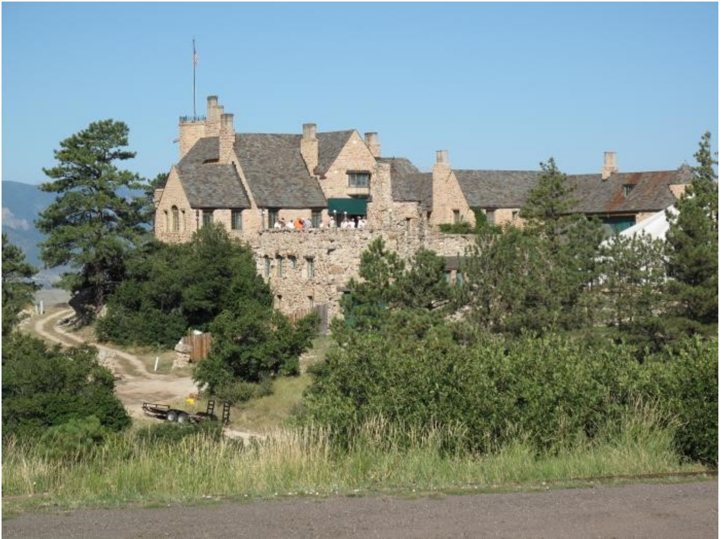
August, 2009 - the Jaguar Club tour of Cherokee Ranch