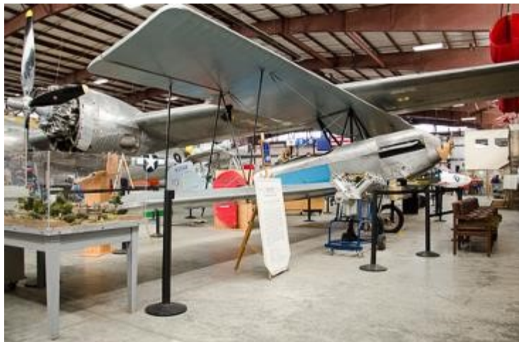
An Alexander Aviation biplane displayed in the Pueblo museum was built in Colorado Springs.