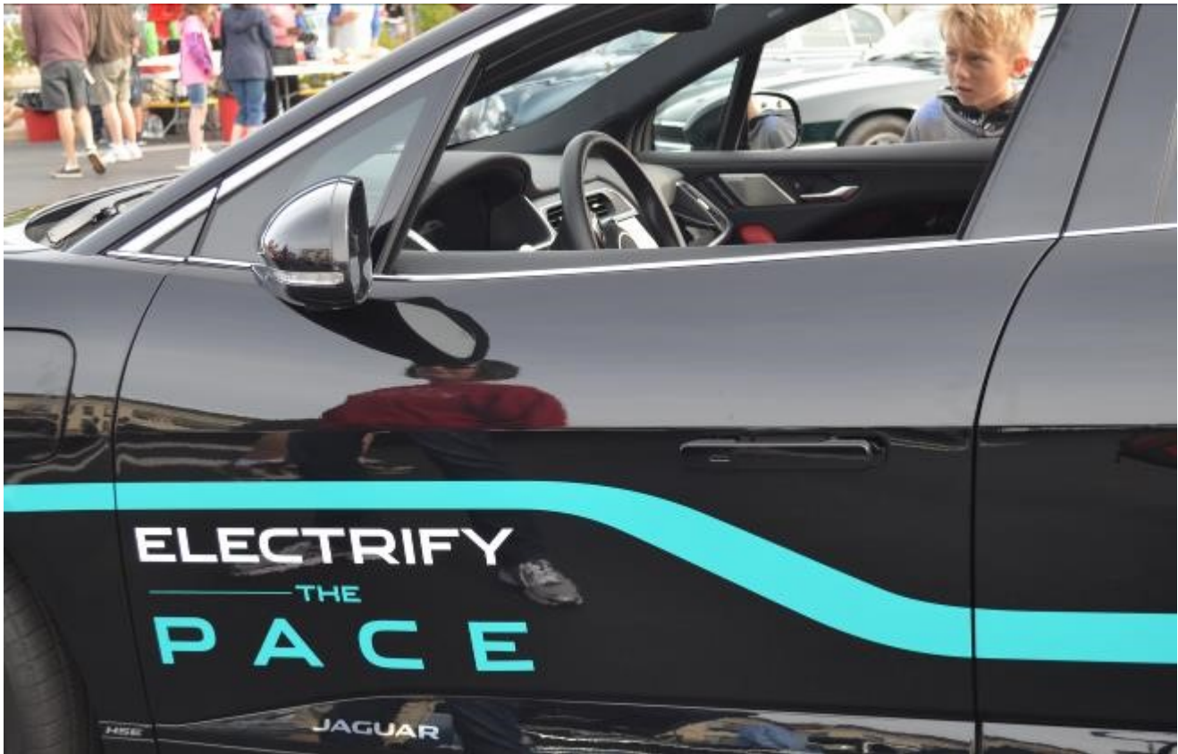
The British Invasion

It's not just the "old timer's" that are interested any more.