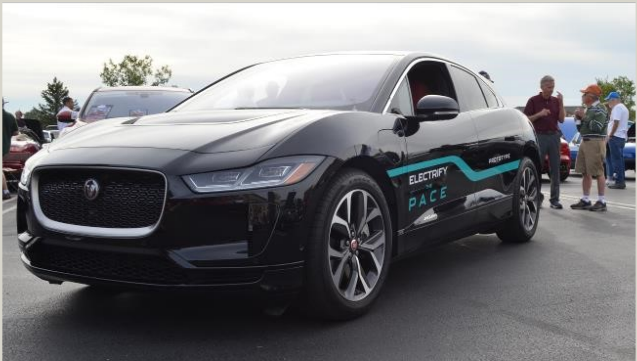
The Jaguar I - Pace

... and suddenly a great silence descended upon them!