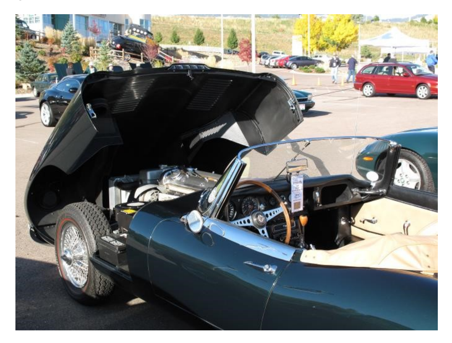
Pikes Peak Concours d'Elegance, October 3, 2009