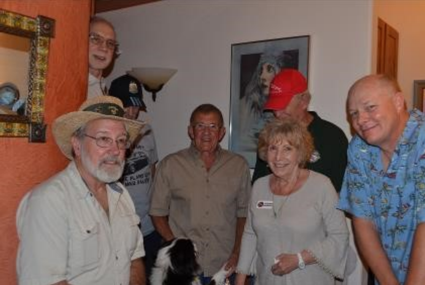
And how many Jaguar drivers can YOU get in your shower?