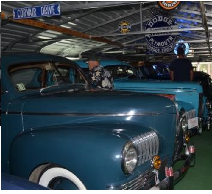
So much to see - an amazing collection!