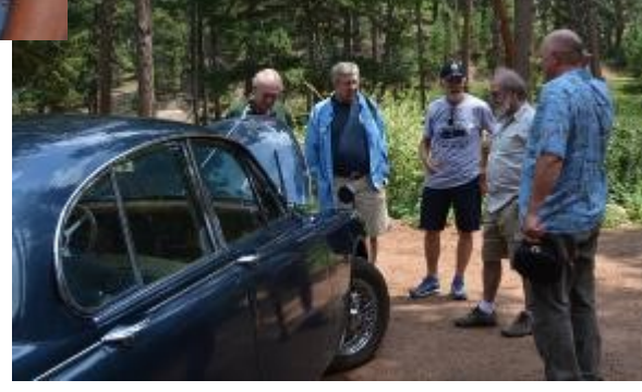
Somebody lost the map so we all have to stay here for a week or two till we figure out how to get home.