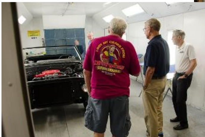
Umm, nice Porsche!