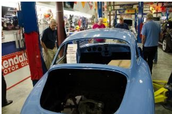
ReinCARnation