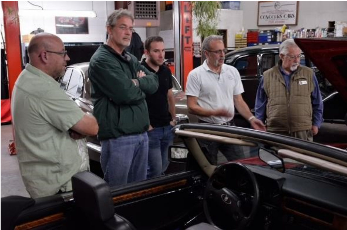
Tour of Concours Cars shops, 2012.