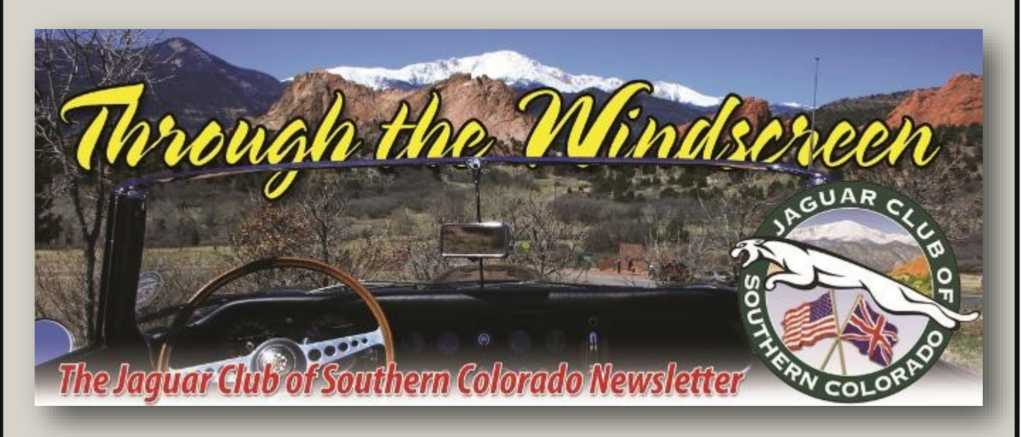
Jags and Java - May, 2018