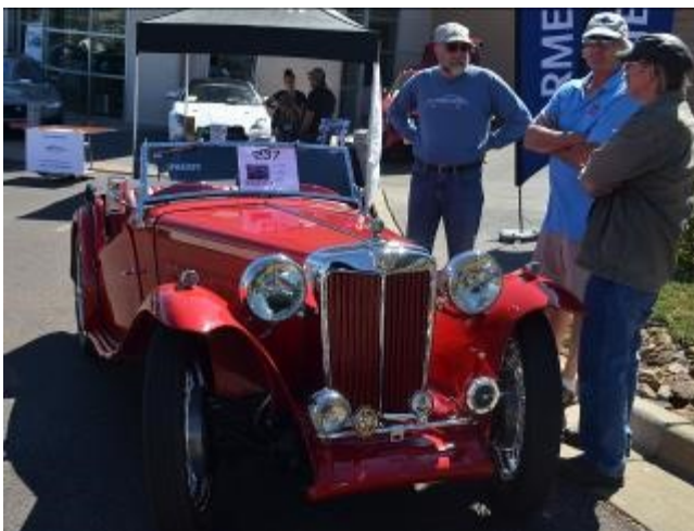
The Peoples Choice MG.