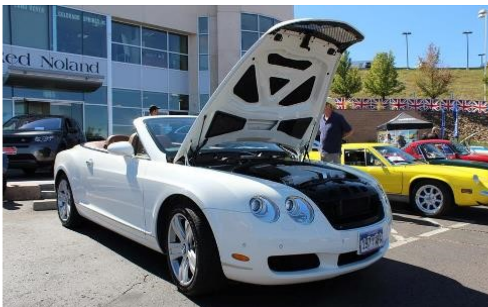
and a Bentley!