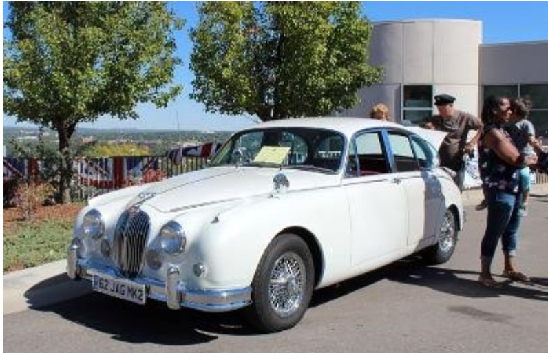
Rory and Emily's 1962 Mk 2