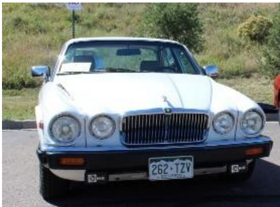
Richard's 1985 XJ 6