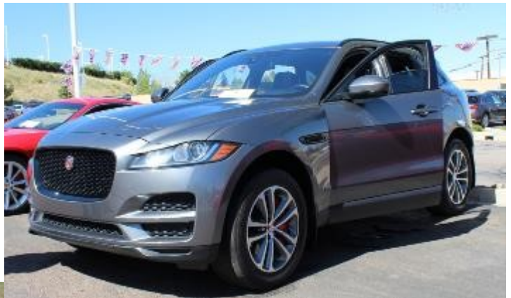
Giovanni's 2017 F-Pace