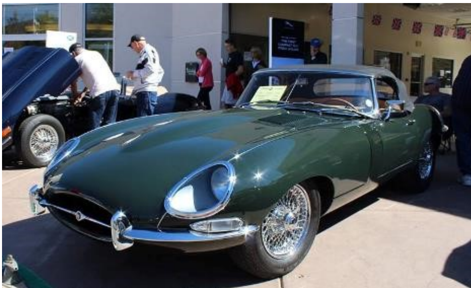
Ted's 1962 E-Type OTS