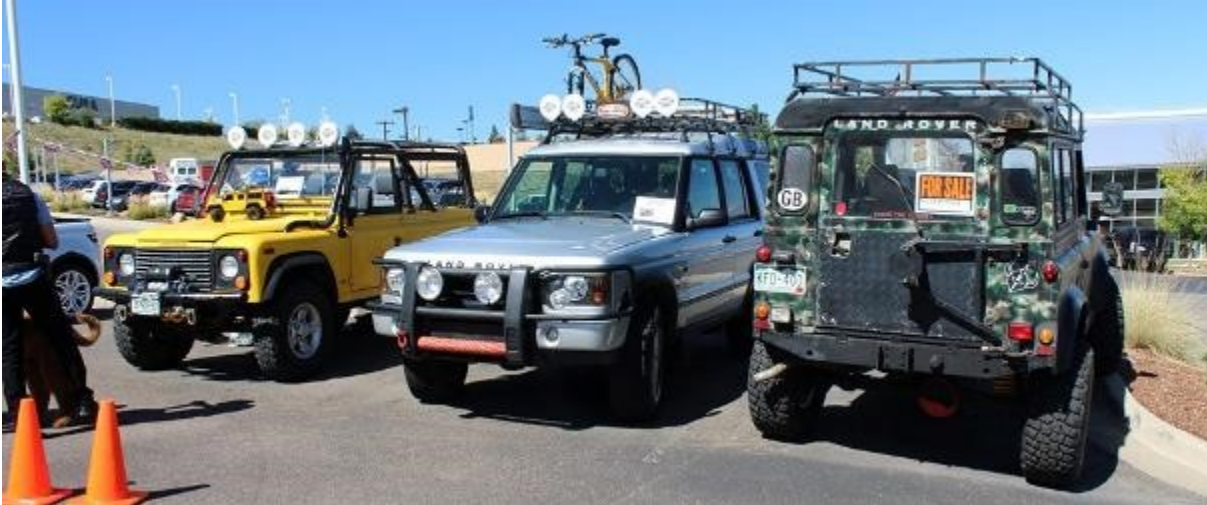
Lots of Land Rovers and a Triumph