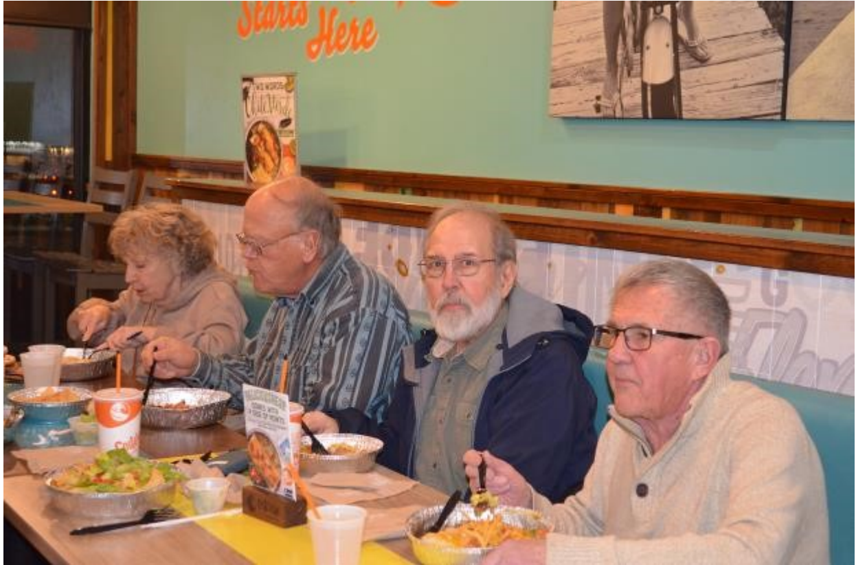
The JCSC dined at Costa Vida off North Gate Road.