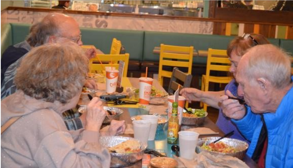
February, 2020 Club dinner.