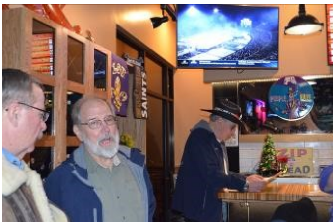
The JCSC group at Mama Pearl's Cajun Restaurant prior to moving to Costa Vida