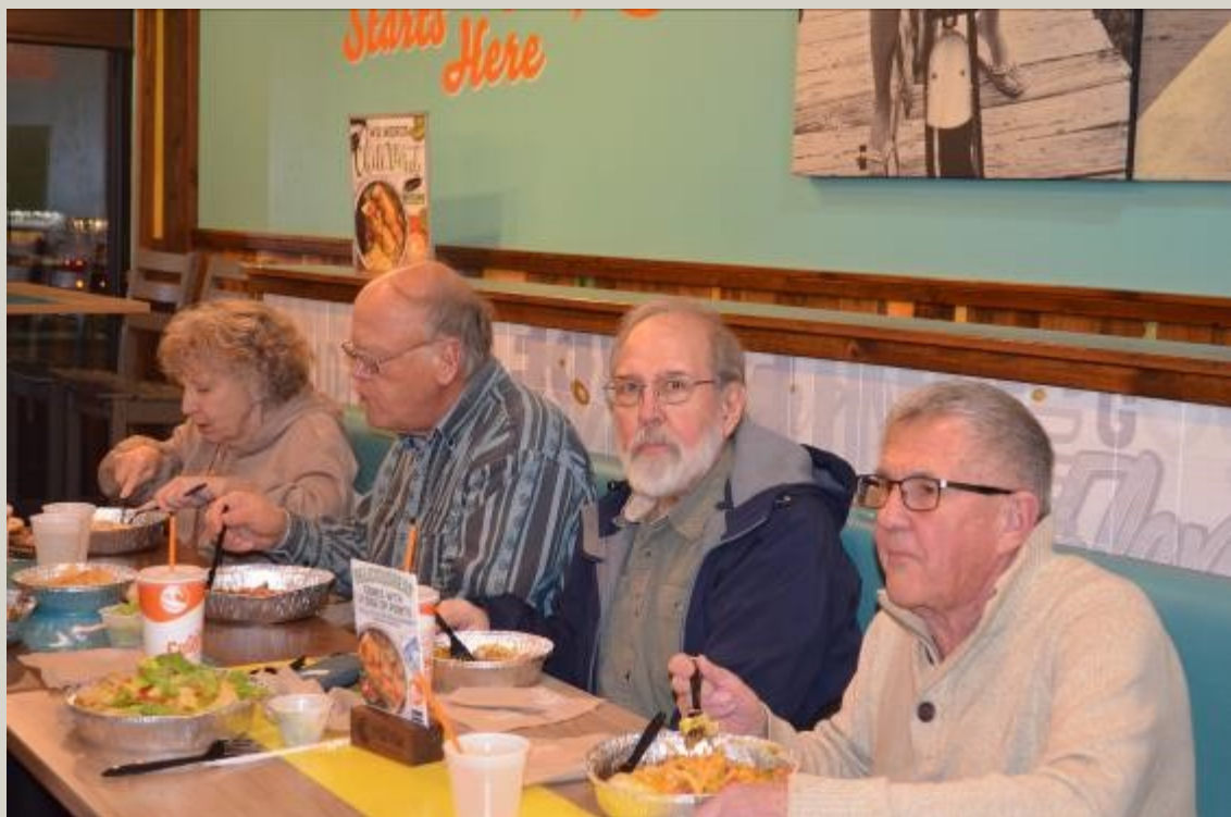
The February JCSC Club Dinner